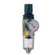
Model: EW1000-M5 EW2000-01 EW2000-02