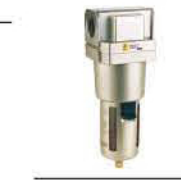
Model: EF5000-06 EF5000-10