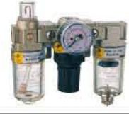
Model: EC1000-M5 EC2000-01 EC2000-02