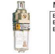
Model: EL1000-M5 EL2000-01 EL2000-02