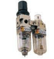
Model: EC1010-M5 EC2010-01 EC2010-02