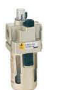
Model: EL2500-02 EL2500-03 EL3000-02 EL3000-03 EL4000-03 EL4000-04 EL4000-06