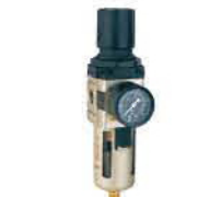
Model: EW3000-02 EW3000-03 EW4000-03 EW4000-04 EW4000-06