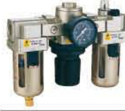
Model: EC2500-02 EC2500-03 EC3000-02 EC3000-03 EC4000-03 EC4000-04 EC4000-06