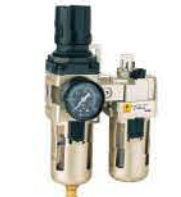
Model: EC3010-02 EC3010-03 EC4010-03 EC4010-04 EC4010-06