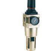
Model: EW5000-06 EW5000-10