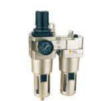
Model: EC5010-06 EC5010-10