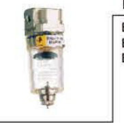
Model: EF1000-M5 EF2000-01 EF2000-02