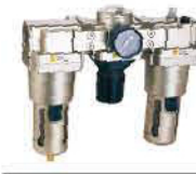
Model: EC5000-06 EC5000-10