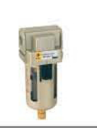
Model: EF2500-02 EF2500-03 EF3000-02 EF3000-03 EF4000-03 EF4000-04 EF4000-06